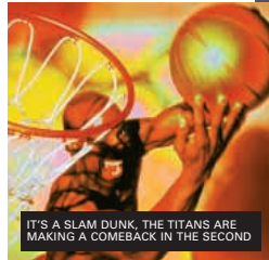
IT'S A SLAM DUNK, THE TITANS ARE MAKING A COMEBACK IN THE SECOND

Visit our Web site for more information on careers in Court Reporting and Broadcast Captioning www.BestFuture.com