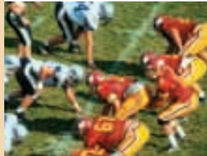
HERE'S THE SNAP, HE LOOKS TO HIS LEFT, THE WIDE RECEIVER FROM